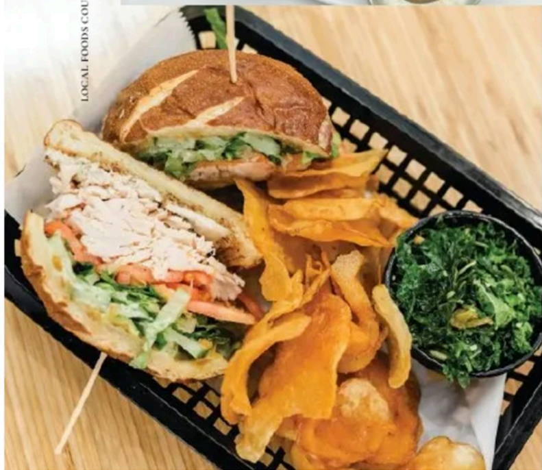
LOCAL FOODS COURTESY OF RESTAURANT; GEORGIA JAMES PHOTO BY DUC HOANG; HOME PHOTO BY IMAGINIMA/ISTOCK